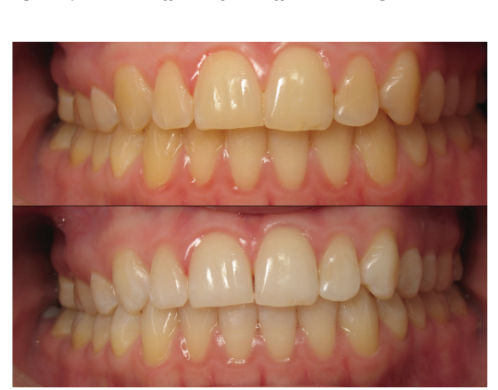
Fig. 7: Clinical case before and after at-home tooth whitening using custom trays.