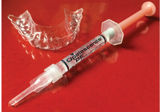
Fig. 8: Opalescence PF kit for at-home whitening.

through the laboratory, an already prepared kit containing ready-to-wear trays can be used (Opalescence Go, Ultradent Products; Fig. 9). In this case, at the first appointment, the patient receives a kit containing a