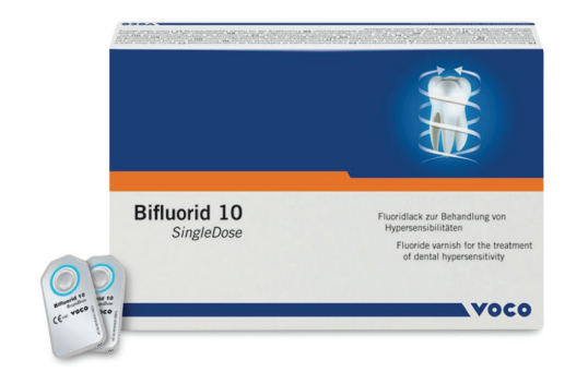
Fig. 16: Bifluorid 10 for in-office fluoride application.