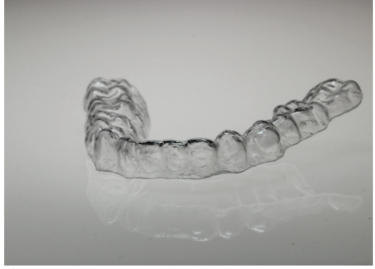
Fig. 6: Custom trays