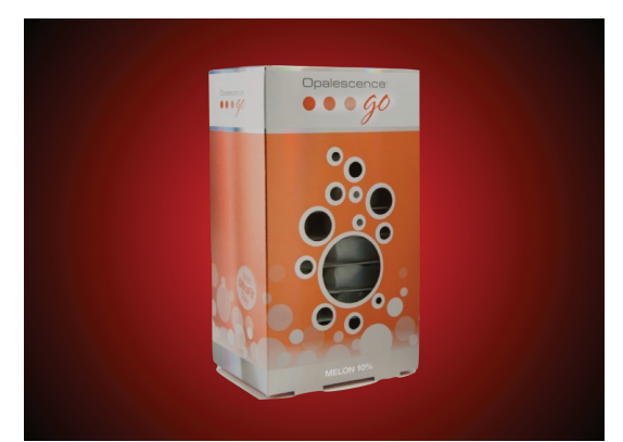
Fig. 9: Opalescence Go kit for at-home whitening.