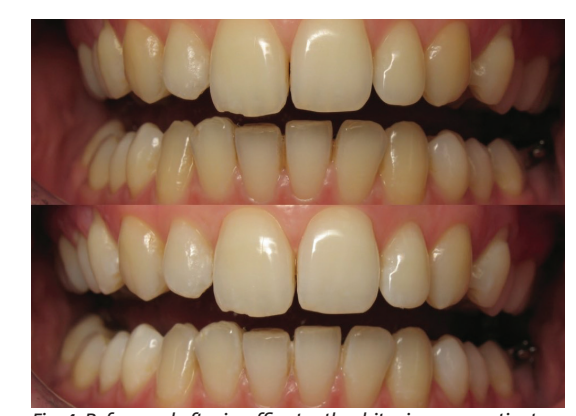
Fig. 4: Before and after in-office tooth whitening on a patient wearing a lingual appliance.