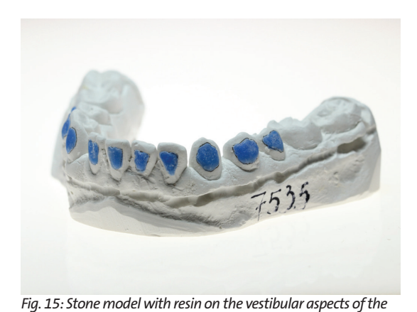
teeth for tray reservoirs.