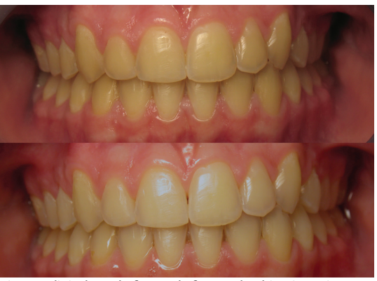
Fig. 10: Clinical case before and after tooth whitening using ready-to-wear trays