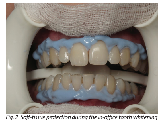
Fig. 2: Soft-tissue protection during the in-office tooth whitening procedure.