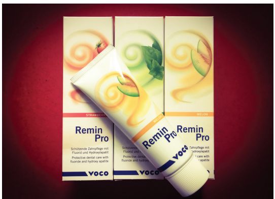
Fig. 13: Remin Pro for home use.