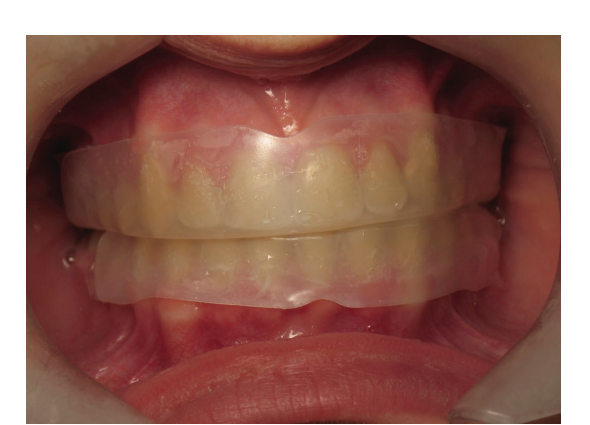
Fig. 11: Pre-filled trays on the teeth.