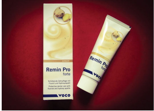
Fig. 14: Remin Pro Forte for home use.