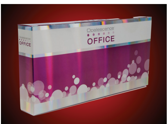
Fig. 5: Opalescence Office kit for in-office whitening.