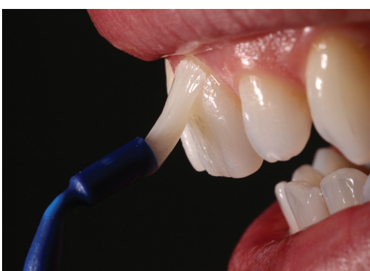
Fig. 12: Profluorid Varnish for dental hypersensitivity treatment.